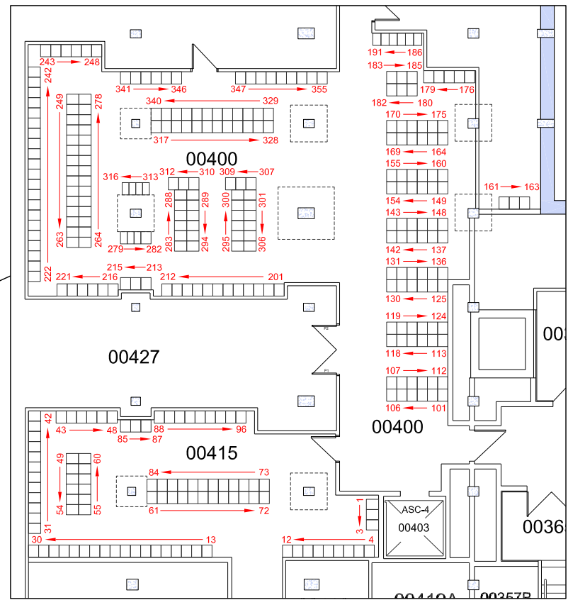
CASIERS LOCAUX 00400 ET 00415